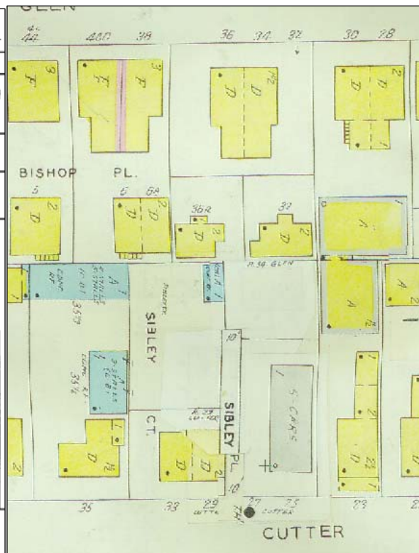
1959 Sanborn Plate 51